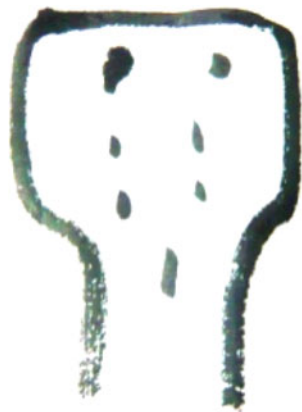
Fig. 1 Oracle bone inscription of “spring” in Chinese (4,000–3,000 years ago)

At the earliest stage, people performed all activities right near the rivers or streams, since they could not live without water. However, surface-water resources were influenced greatly by the seasonal precipitation and this risk was the driving force for ancient people to explore more stable water resources like groundwater. Ever since the invention of wells, human beings have been able to live far away from surface-water resources, which then greatly expanded their territory of activities. In some ancient books, like in Shi Ben ( Origin of the World , written in the Warring States Period [475 BC–221 BC]), it says that “Boyi made the well”. Legend tells that Boyi was from the time of Yu Shun, in other words, the time when primitive communes were just about to disintegrate and slavery was about to rise (right before the Xia