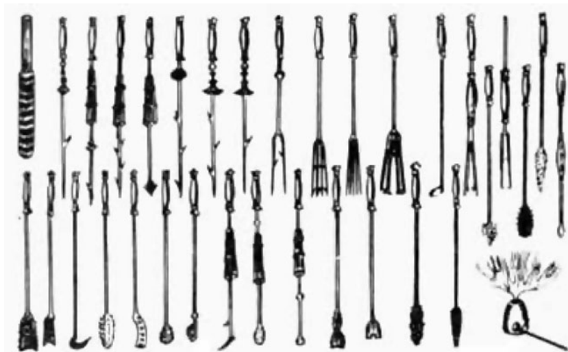
Fig. 6 Ancient Chinese well-drilling tools.