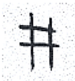
Fig. 3 Oracle bone inscription of “well” in Chinese

When China entered the period of the primitive commune system of paternal clans (2550 BC–2140 BC), and along with the development of settled residence and agriculture production, wells were already widespread with greater depths and better structures. Shen (1979) summarized well history based on the archeological materials as follows: Jiangou well of Handan City in Hebei Province and Cuoli well of Luoyang City in Henan Province of Longshan culture (2800 BC–2300 BC): the depths were from 6 to 7 m; Taixi well (in Hebei Province) from the Shang Dynasty was rectangular with a depth of almost 10 m and wooden rings inside; Jiaozhuang well