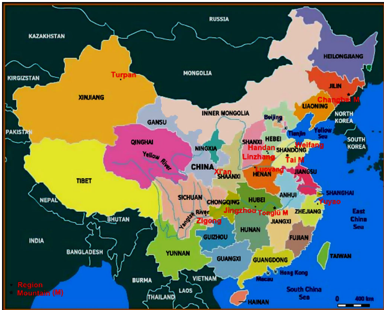
Fig. 9 Map of China with the main locations mentioned in this report, adapted from China Tells (2009)