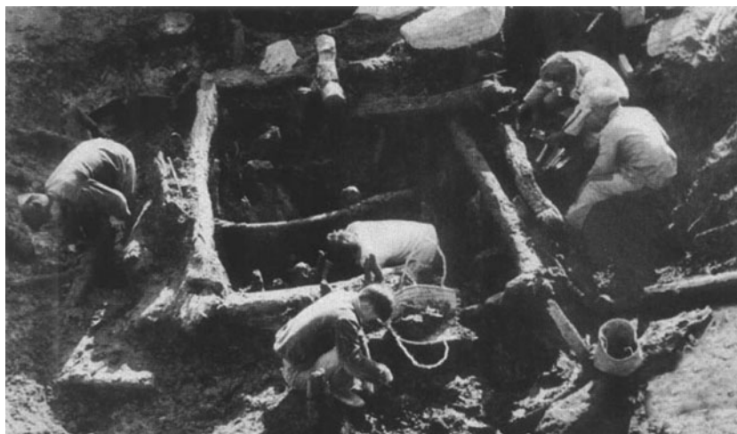
Fig. 2 The Hemudu well under excavation in 1973 (The Museum of the Hemudu site 2002)

Dynasty); however, the Hemudu well was much earlier than this time.